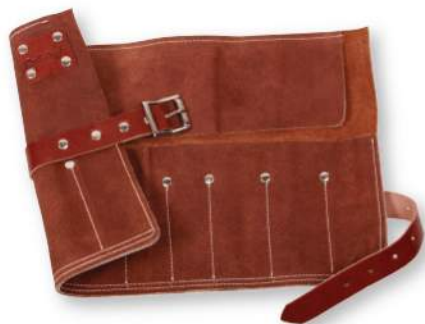
Leather Tool Roll

Our signature tool roll is hand stitched in split leather and is hardy enough to outlast many of its owners. Our tanning process maintains a natural brown finish which is punctuated with ivory stitch and silver rivets. It provides practical storage for protecting and transporting tools in distinguished style.