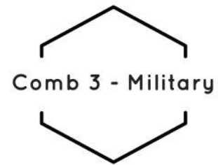
Comb 3 - Military

Longer comb designed for styling and grooming.