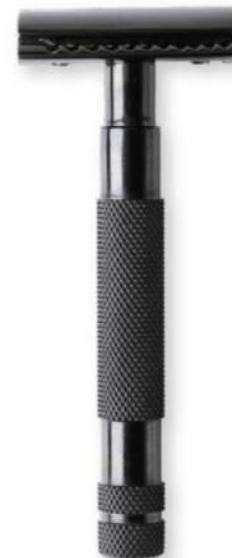
SR+ Safety Razor

The SR+ is produced in a heavy duty, hard wearing steel with a nickel alloy head. The additional weight provides stability - enhanced by it's knurled grip. The black plasma coating is durable and its look improves with age and use.