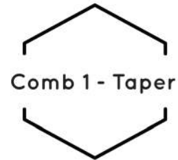
Comb 1 - Taper

Popular style for barbering with great flexibility and ideal for scissor over comb work.