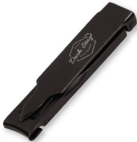
Mans Nail Clipper

The Dark Stag Man's Nail Clipper uses an ultra slim design to minimise precious pocket or man drawer space. The innovative folding lock design means no sharp edges are exposed while not in use, protecting your pocket and keeping the blades sharp. The durable spring system will make cutting smooth and the mechanism will not become loose over time. Finished in stealth black, this grooming gadget provides powerful clipping capabilities.