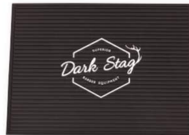
Barber Station Mat

Preserve your worktops or work station with our Rubber-PVC Polymer Barber Station Mat. This durable accessory provides grip to prevent essential tools slipping and dropping. Our unique Rubber-PVC mix has been specially formulated to provide the ultimate heat resistance for placing warm clippers without damage. Our mat is easy to clean and enhances any organised work station.