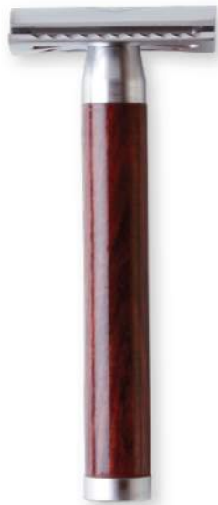
SR1 Safety Razor

Using widely available double edge blades our safety razors are an elegant yet economical alternative to today's disposable plastic.