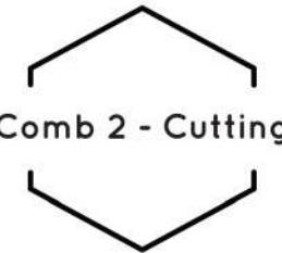
Comb 2 - Cutting

Excellent all-round cutting comb suitable for scissor over comb work.